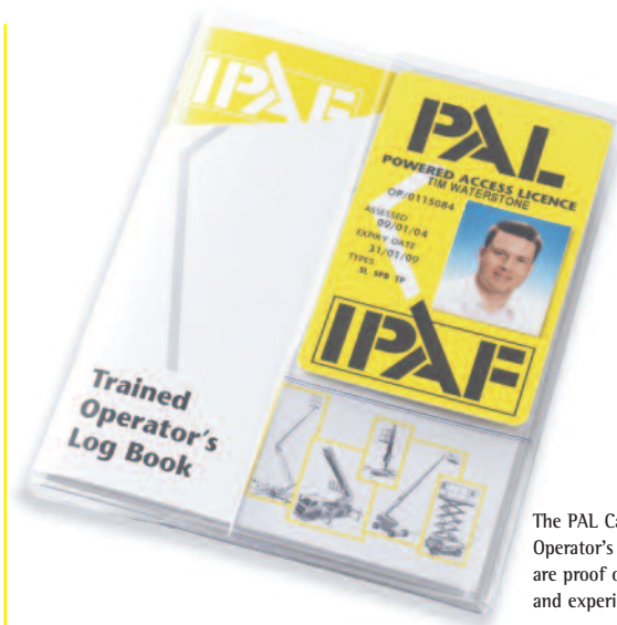
The PAL Card and Operator's Log Book are proof of training and experience.